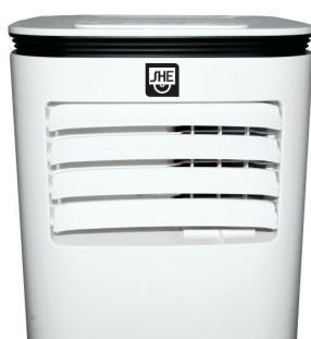
Detail view front