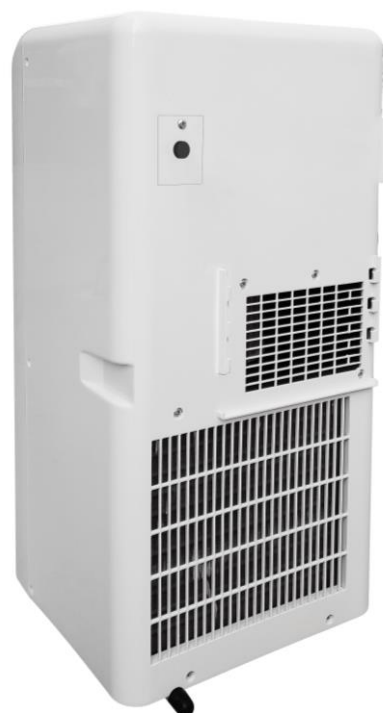
Exhaust air hose connection 150 mm hose diameter