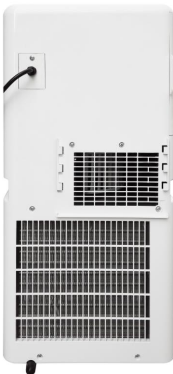
Condensed water drain plug