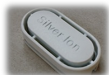
ION filter (optional) Art.no. BCIONF003