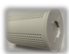
Limescale filter (included) Art.no. BCKALKF002