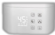
The LED display shows all functions