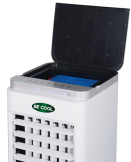
Detail view - open