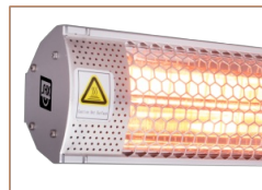
Halogen ("Golden Lamp")