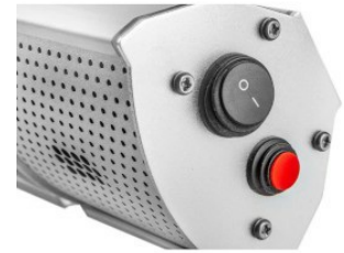
Main switch and operating light