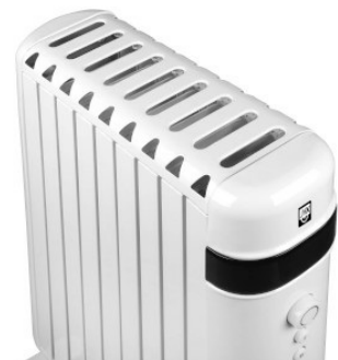
Detail view top side