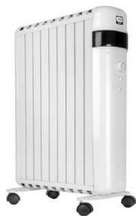
Oblique view right 1