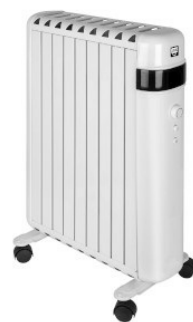
Oblique view right 2