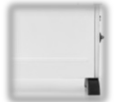
Simply put down