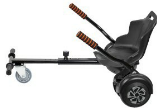
Side view (with Self-balancing board)