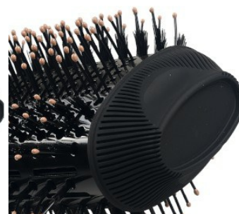
Detail view 1