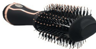
Oblique view lying