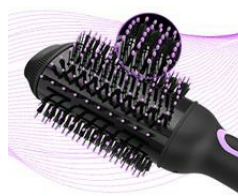
Curling & Smoothing