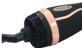
Detail view 2