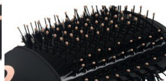
Detail view 3