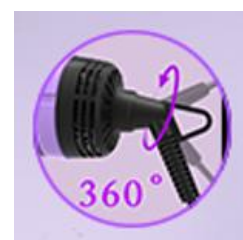
360° rotatable cable