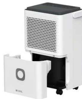
Oblique view with water tank