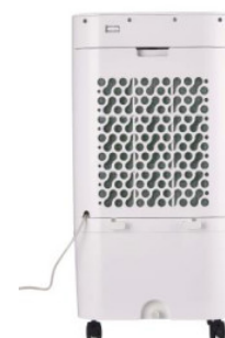
Water tank can be emptied via the closure on the underside