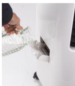
Water tank can be filled on the underside