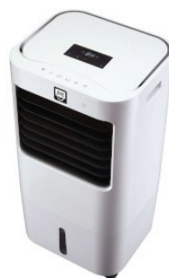
Oblique view top side