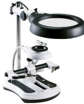
Oblique view right