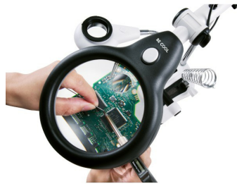
Application example main magnifier