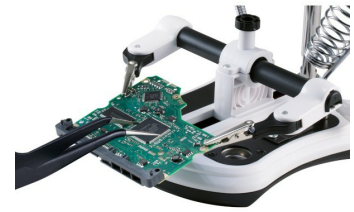
Application example 3rd hand