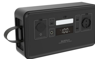
Oblique view right with loop