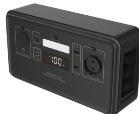
Oblique view top left