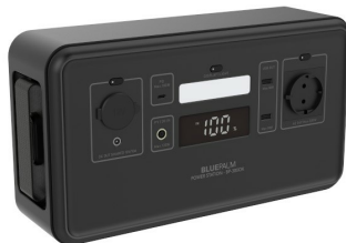
Oblique view right