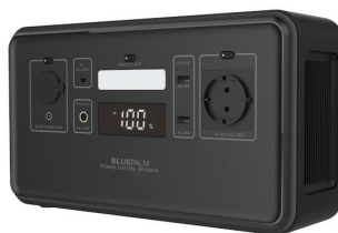
Oblique view left