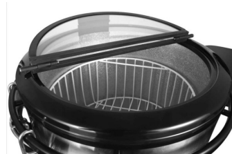
Glass lid & basket