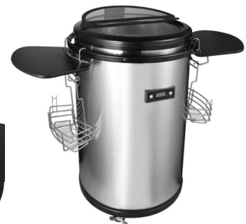
Oblique view right