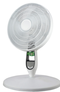
as a table fan