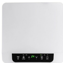
Detail view top side