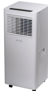
Oblique view left