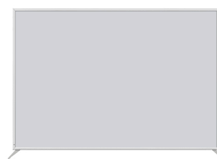
Front view with stand