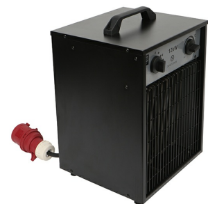
Oblique view right