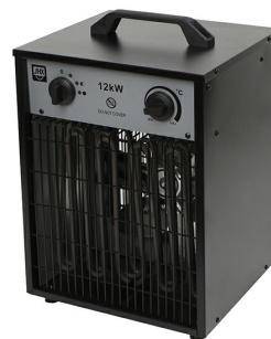
Oblique view left